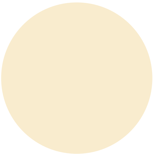
BENJAMIN MOORE CALCITE